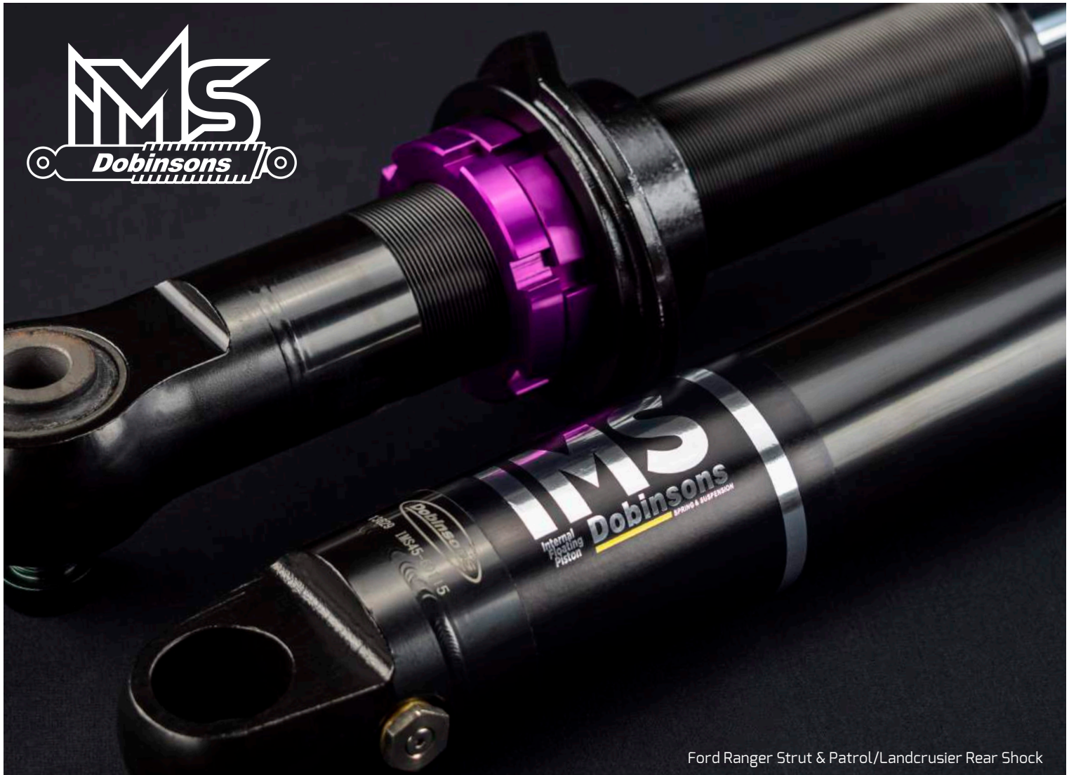
Ford Ranger Strut & Patrol/Landcruiser Rear Shock

Dobinsons IMS Monotube Shock Absorbers are designed for next level performance over Twin Tube Shocks in those hot, harsh, demanding conditions. By utilising the Monotube design, Dobinsons IMS Shock Absorbers are able to resist fade far longer on corrugated roads, long or hard working 4WD trips, towing or racing conditions.