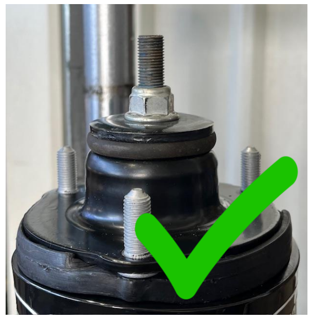
The top bush and the bottom bush is tight now.

Dobinsons Springs and Suspension Head Office – Rockhampton, AUSTRALIA Brisbane – Sydney – Melbourne - Adelaide