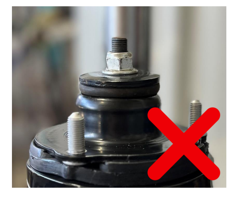
Not enough thread showing. The top bush may appear tight as there is force against it form the coil spring, however the bottom bush will still be loose.